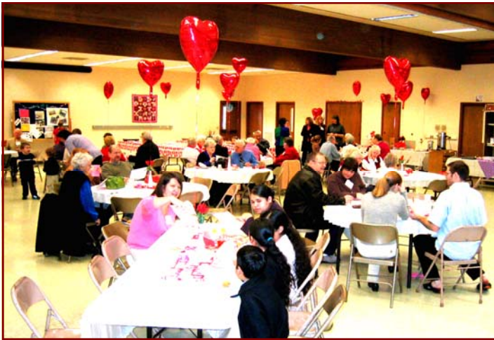
Valentine's Day Pot Luck 2007