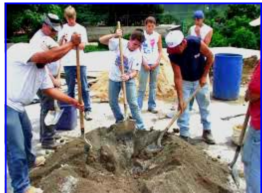
Volunteers in Honduras